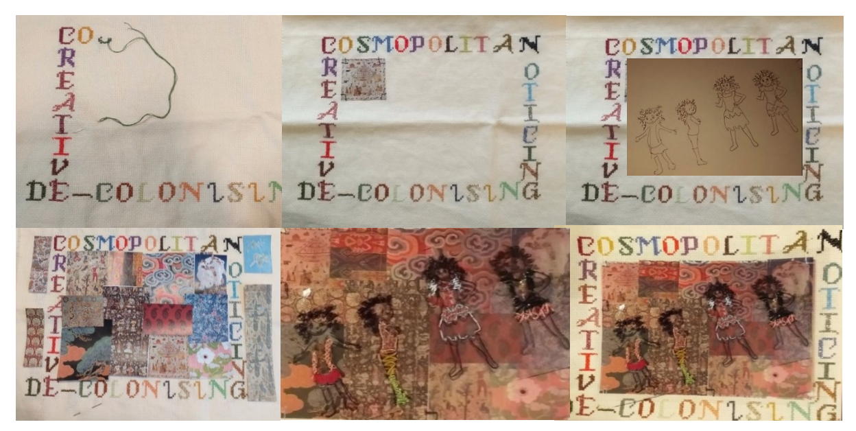
Figure 5: Beverley Hayward, (2021-22) Journal Pages: conceptualisation of ideas and preparation.