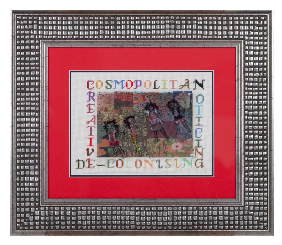
Figure 2: Beverley Hayward and Chrissie Peters, Travelling in a Cosmopolitan Milieu , (2022), embroidered collage with paper and acetate.