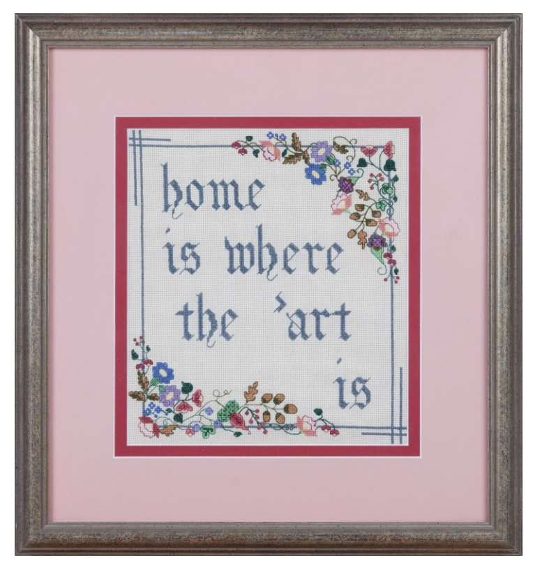
Figure 8: Beverley Hayward, Sewing Sampler: Home Is Where the Art Is, 2014, tapestry, private collection.