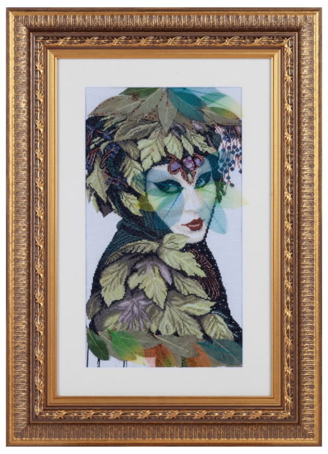
Figure 9: Beverley Hayward, Mocking the Master Narrative: The Masquerade, 2015-19, tapestry and mixed media, 30 x 40 cm, private collection.