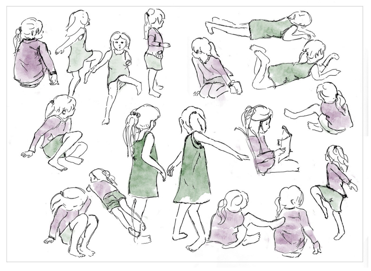
Figure 4: Chrissie Peters, 2015. Amended multicultural illustrated character for children's book, final sketch 3.