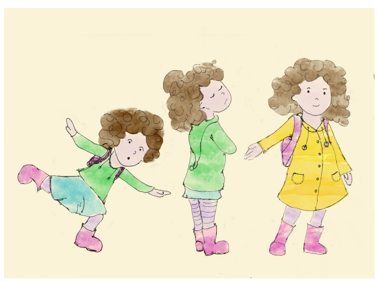
Figure 3: Chrissie Peters, (2015). Amended multicultural illustrated, character for children's book sketch 2.