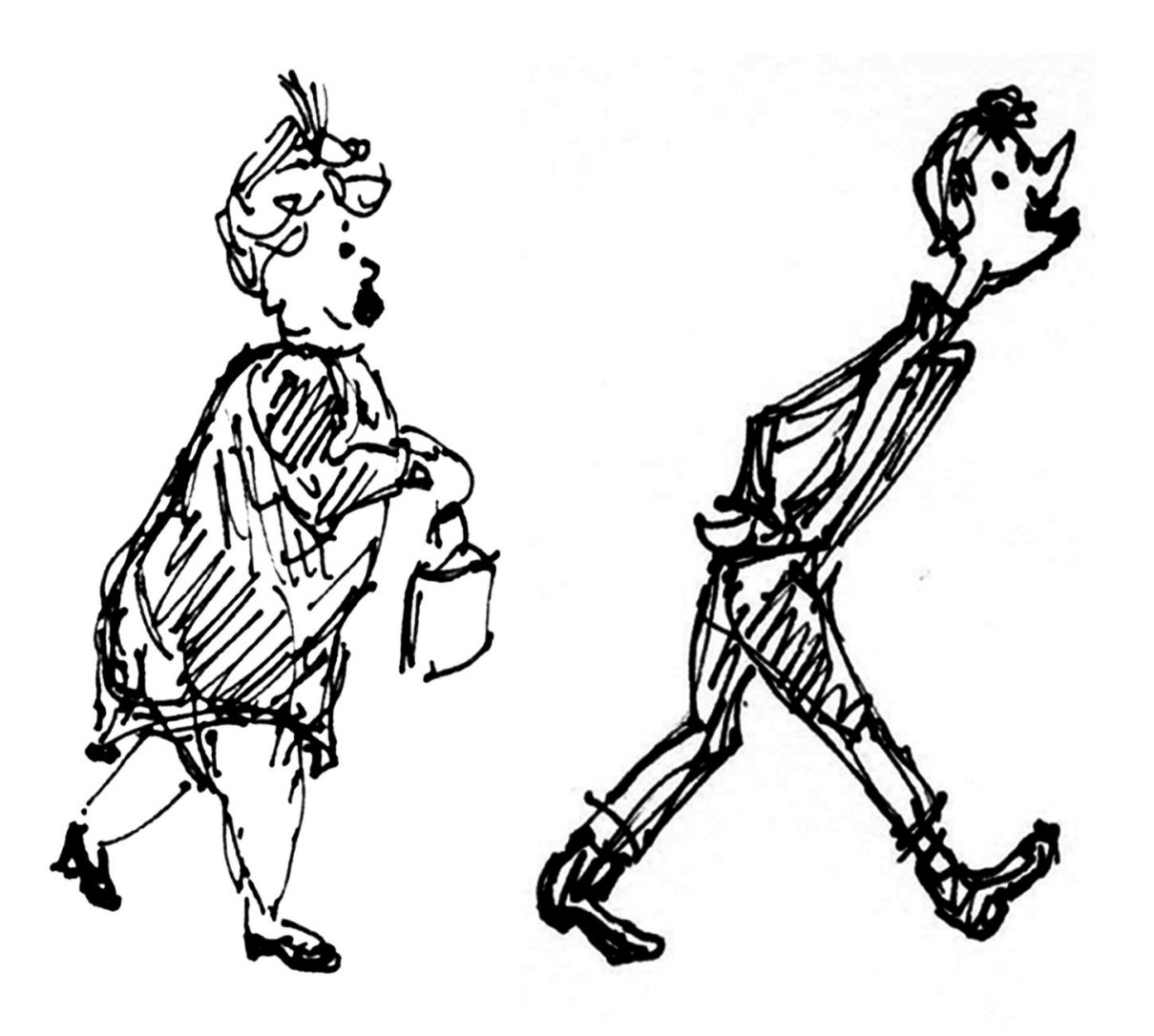
Figures 6 and 7: Chrissie Peters, (2015). Multicultural characters for New Designers.