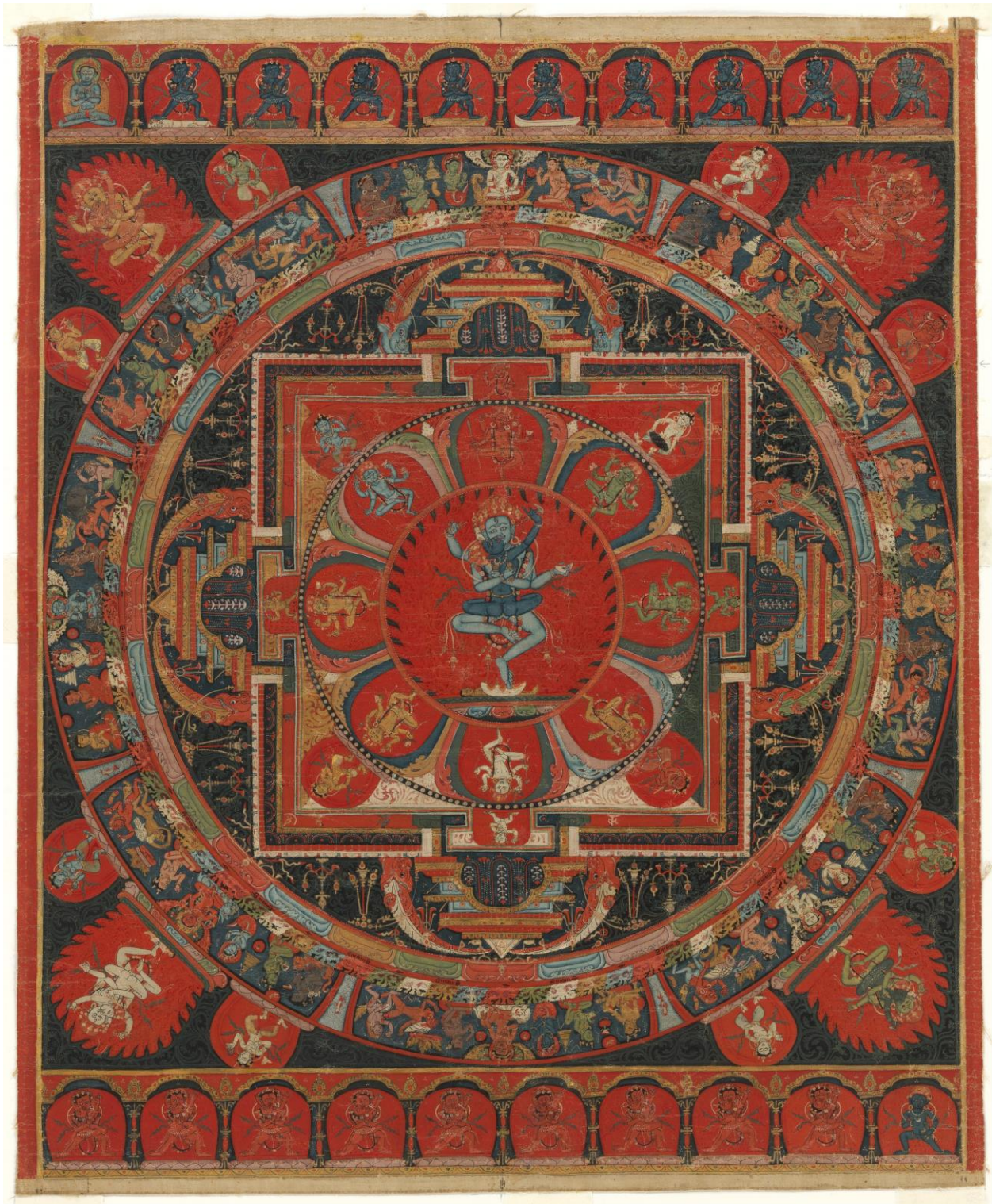
Vasudhara Mandala dated to 1777 (Samvat 897) - Metropolitan Museum of Art

pre-service teachers may begin to understand the psychodynamics of such conflicts and the ways they may be depotentiated in the future thereby transforming their pedagogy. Since some readers may not be familiar with some of the terminology presented in this paper, a glossary of terms has been provided.