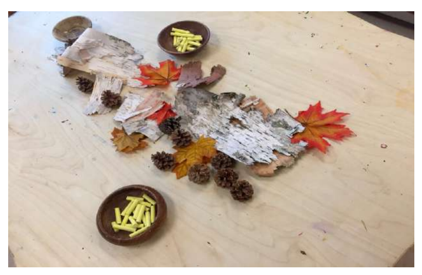
Figure 14: Sample provocation featuring birch bark, pine cones and yellow chalk

In operation since the early 1980's, Gather Round is a non-profit childcare centre in a coastal Canadian city. As a demonstration site for a local early childhood educator training program, it is host to many students and interns. Gather Round is one of three centres in the area that feature this mentorship design and, as such, staff report high levels of job satisfaction, with the average teacher employed for five or more years. While Gather Round features three separate classrooms, in the preschool classroom, where this study was situated, up to twenty-two students and four teachers learn together.